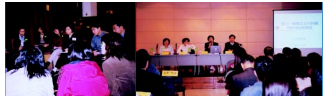
職業康復服務工作坊 Workshops on Vocational Rehabilitation Services

These recommendations would be actively pursued in 2003-04. In 2002-03, one SW, one SE unit and one DAC operated by the Department were closed/hived off to NGOs. Briefing sessions, workshops and focus group meetings had been organised to collect views from NGO operators, frontline workers and parents on the implementation of integrated service delivery model in vocational rehabilitation services. With the transfer of subvention of two skills centres of NGOs from the Health, Welfare and Food Bureau to SWD on 1 April 2003, these two centres will be converted into integrated vocational training centres to provide vocational training, retraining and sheltered employment services.