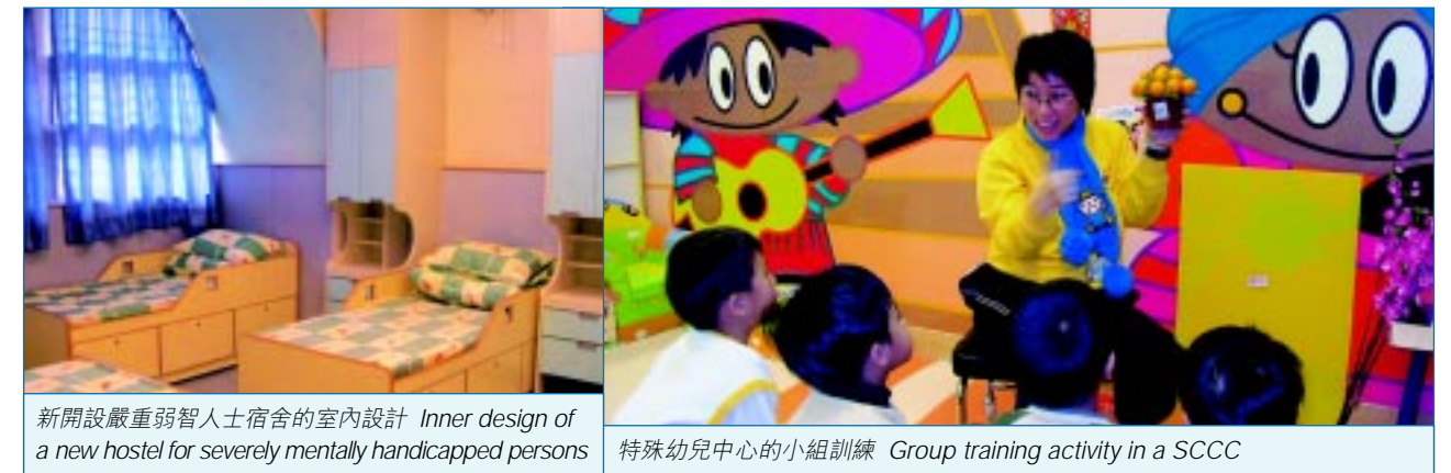
新開設嚴重弱智人士宿舍的室內設計 Inner design of a new hostel for severely mentally handicapped persons