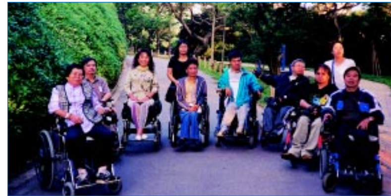
肢體傷殘人士進行戶外活動 Outdoor activity of physically handicapped persons