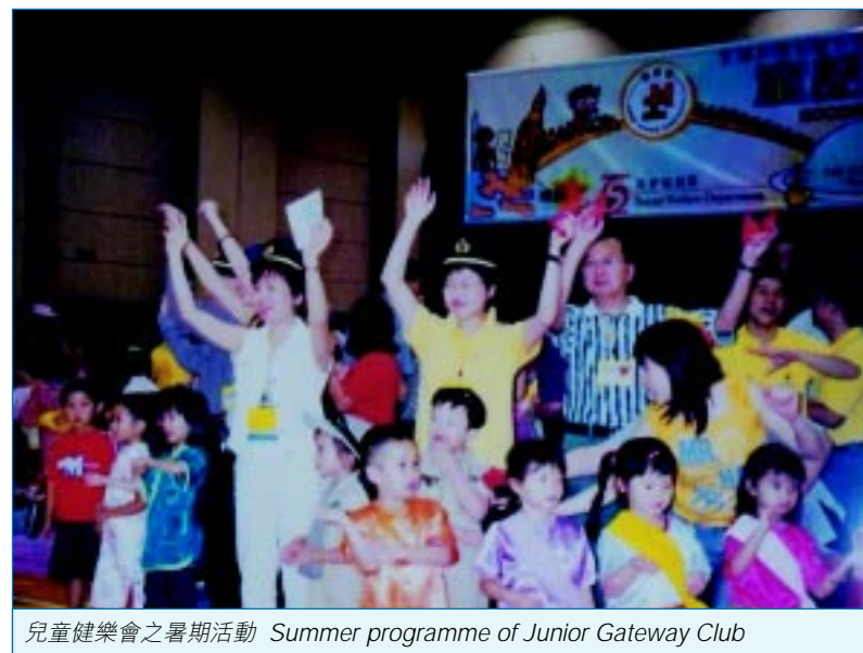
兒童健樂會之暑期活動 Summer programme of Junior Gateway Club