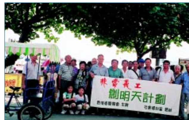
聽覺受損人士的義工活動 Volunteer activity of hearing impaired persons