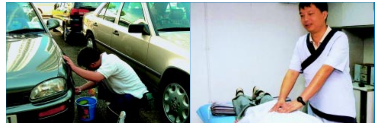
汽車美容服務 Car beauty service 流動按摩服務 Mobile massage service