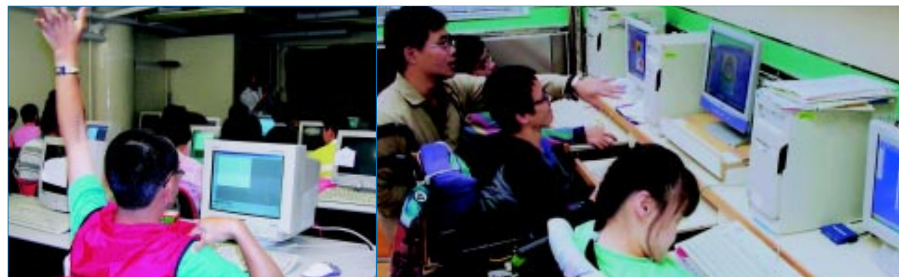
智障人士資訊科技訓練 IT training for people with mental handicap