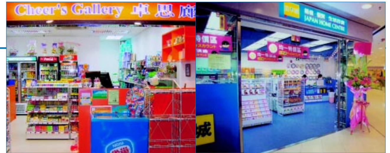
位於律敦治醫院之便利店 Convenience Store at Ruttonjee Hospital 日本城 The "Japan Home Centre"

Provision to promote self-reliance for people with disabilities through vocational rehabilitation include — ◆ Over 9 000 places in SW and SE service. ◆ The 3-year project of "On the Job Training Programme for People with Disabilities" (OJT Programme) in which 1 080 disabled persons will benefit from extra-incentive of job attachment allowance and wage subsidies. Up to March 2003, 293 disabled participants had secured open employment through the Programme with average earnings of $4,170 a month, ranging from the lowest of $1,000 (part-time job) to the highest of $12,700.