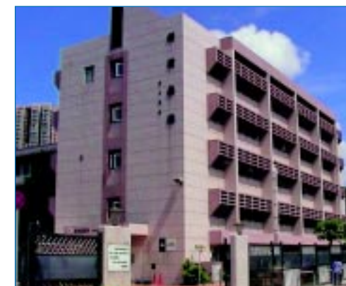
舊粉嶺醫院高座 High Block of Ex-Fanling Hospital

In 2002, the Department took over the vacated premises of the Fanling Hospital (FH) from the Hospital Authority for conversion into a medium-size rehabilitation complex providing 200 day and residential places. This is an example of making use of vacant hospital premises to provide rehabilitation facilities for people with disabilities in an expedient and cost-effective way. A grant of $32 million was allocated from the Lotteries Fund (LF) for the refurbishment. The operation of this complex at FH was allocated to Hong Chi Association under a quality-based open competitive bidding process in December 2002. The new service would commence operation in 2003-04.