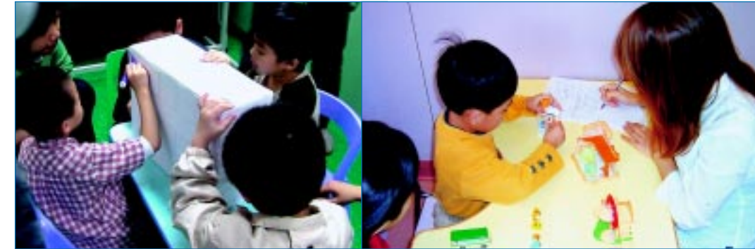
言語治療服務的個別及小組訓練 Individual and group training of speech therapy