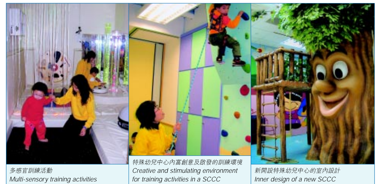
多感官訓練活動 Multi-sensory training activities