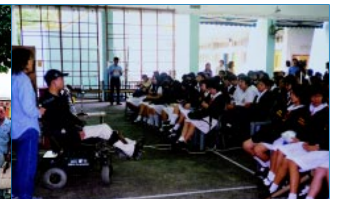
於中學舉行的公眾教育活動 Public education for secondary school students