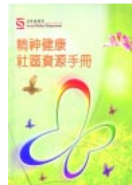
精神健康社區資源手冊 Mental Health Community Resources Handbook