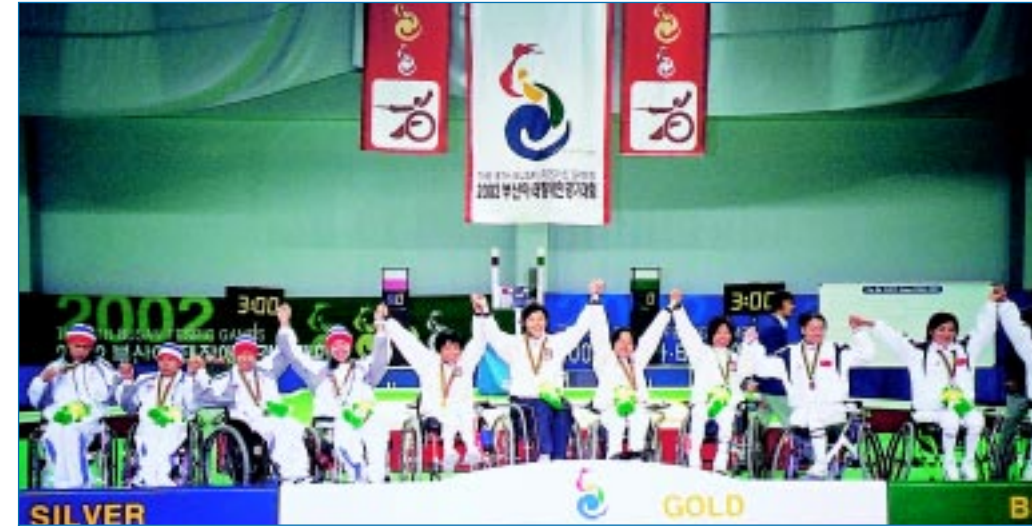
2002年10月在韓國舉行的第八屆遠東及南太平洋區傷殘人士運動會 FESPIC Games held in Korea in October 2002