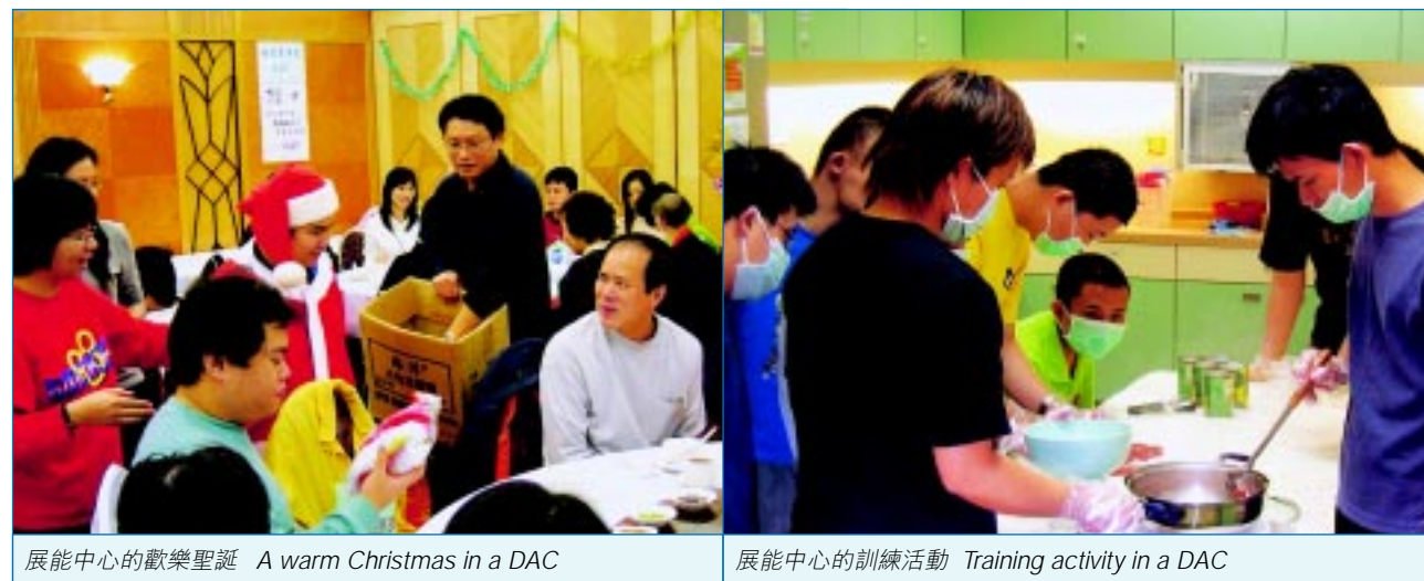
展能中心的歡樂聖誕 A warm Christmas in a DAC

To meet the demand for services, 417 new places were added in 2002-03 including 173 DAC places; 137 residential places and 107 places for pre-school services for disabled children.