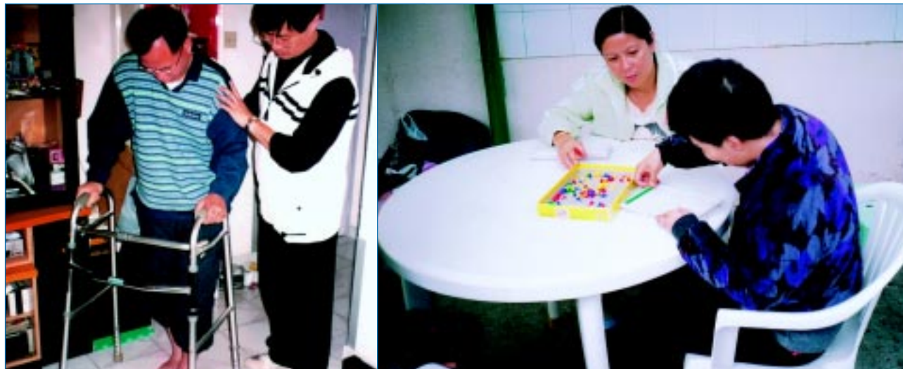
家居訓練及支援服務隊所提供的訓練活動 Training activity of HBTS

To strengthen community support services, home-based training teams were strengthened and expanded to form 20 HBTS teams. The new service intensifies the training provision for mentally handicapped persons, encourages training in a flexible mode, provides occupational therapy service and introduces support network for families of people with disabilities. A total of 1 502 training places were provided as at March 2003 with 3 500 families included in the support network.