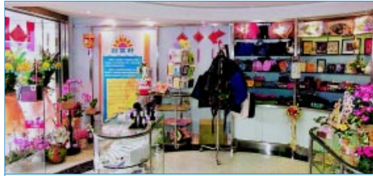
「創業軒」旺角商店 SEPD Mongkok Kiosk

◆ 康復服務市場顧問辦事處聘任有商界和市場推廣經驗的人員，透過積極主動的市場推廣及業務發展策略，致力推介庇護工場、輔助就業及其他職業復康單位的服務和製成品。在 2002-03 年度，康復服務市場顧問辦事處共為庇護就業服務單位取得超過 437 項工作訂單和 10 份招標合約，總值 491 萬元，並為殘疾人士帶來逾 70 份全職和兼職工作。康復服務市場顧問辦事處亦管理由「創業軒」設立的兩間售賣殘疾人士製作手工藝品之商店，2002-03 年度的營業總額約 33 萬元。