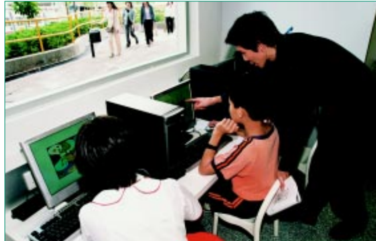
現代化的綜合青少年服務中心設施齊備 A well-equipped modernised Integrated Children and Youth Services Centre