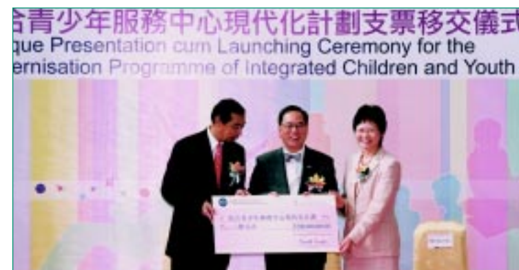
署長林鄭月娥接受香港賽馬會的捐款，作為青少年服務中心現代化計劃之用 Mrs Carrie Lam, DSW, received a donation from the Hong Kong Jockey Club for the Modernisation Programme of Integrated Children and Youth Services Centres

The Understanding Adolescent Project (UAP) which aims at early identification of the developmental needs of young people and assisting them through appropriate primary preventive programme, was rolled out to a further 105 secondary schools in the 2002/03 school year, making a total of 255 schools implementing the project.