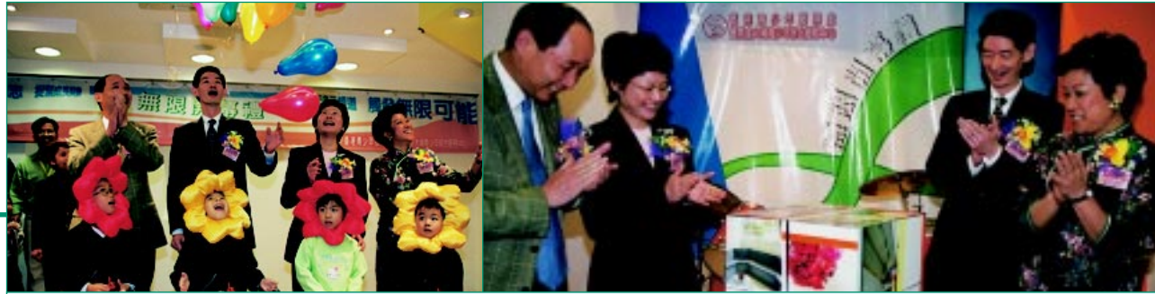
香港青少年服務處賽馬會大埔青少年綜合服務中心開幕禮 Opening ceremony of Hong Kong Children and Youth Services Jockey Club Tai Po Children and Youth Integrated Services Centre