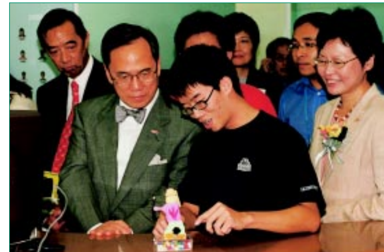
署長林鄭月娥陪同政務司司長曾蔭權參觀現代化的綜合青少年服務中心 Mr Donald Tsang, CS, accompanied by Mrs Carrie Lam, DSW, visited a modernised Integrated Children and Youth Services Centre

Services for young people aim at developing the potential of youth, facilitating their healthy development and assisting them to face challenges from family, peers, school and society, and fostering in them a sense of citizenship with commitment to the community.