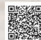
Bahasa Indonesia (Indonesia)