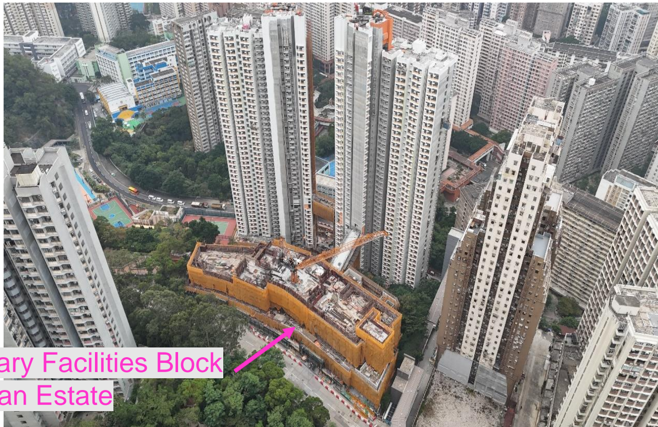
Ancillary Facilities Block Hiu Yan Estate