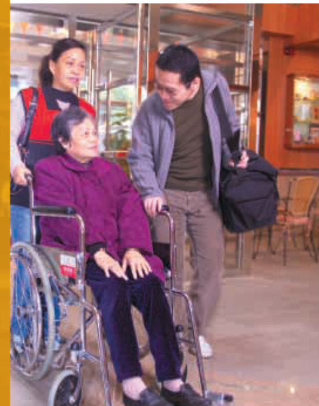
Residential Respite Service for Elders